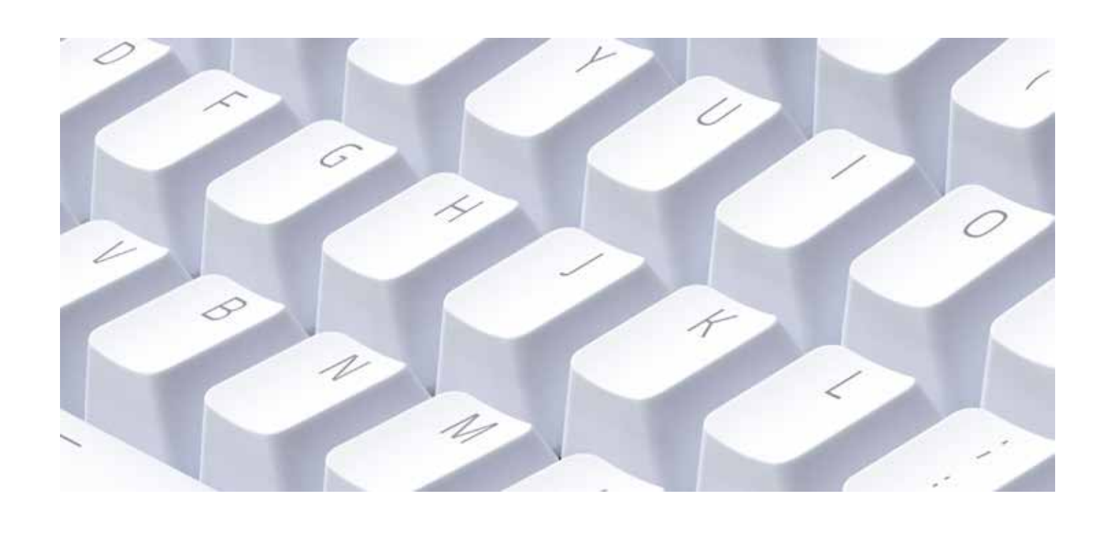
All keys are customizable Set the function of each key according to your preference

No need to install additional software to adjust the light intensity and conversion effect